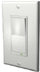
Shown with supplied Decora™ trim plate